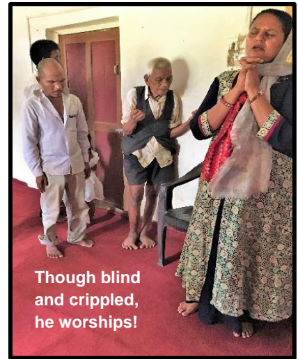
Though blind and crippled, he worships!

Our visit to Nepal was also a time for us to encourage a mid-wife who arrived there last November. It was a much-needed and timely connection as she is facing many challenges. Please pray for B. to get the necessary visa in order to stay and train Nepali women to be mid-wives!