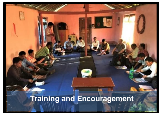
Training and Encouragement

Seattle USA PO Box 398 Mountlake Terrace, WA 98043 info@actionusa.org 425-775-4800