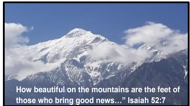
How beautiful on the mountains are the feet of those who bring good news..." Isaiah 52:7